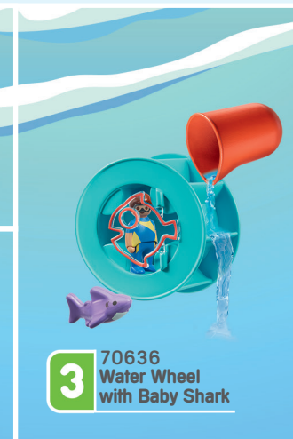
3 70636 Water Wheel with Baby Shark