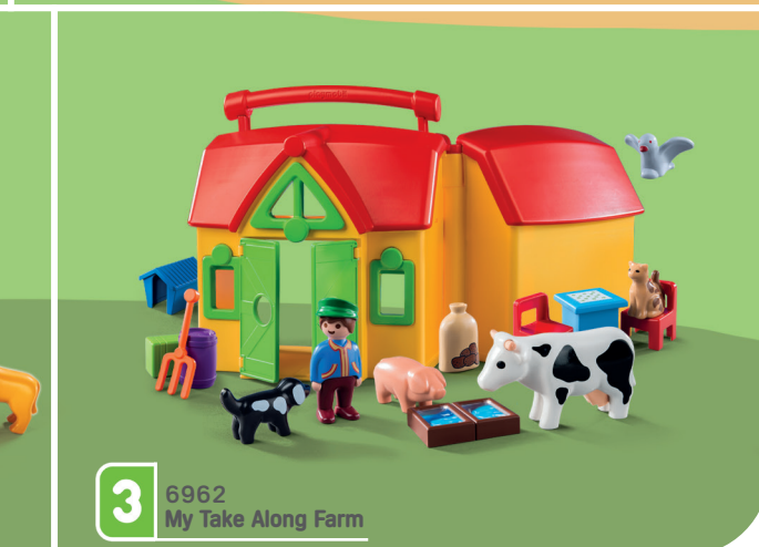
3 6962 My Take Along Farm