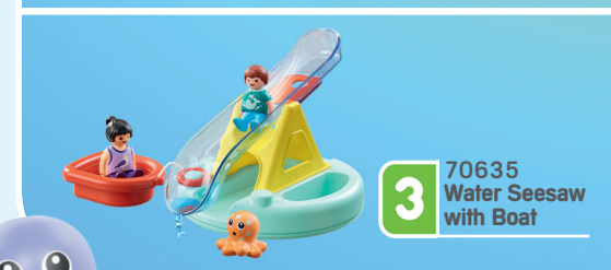
3 70635 Water Seesaw with Boat