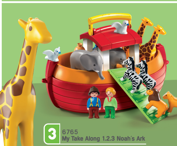
3 6765 My Take Along 1.2.3 Noah's Ark