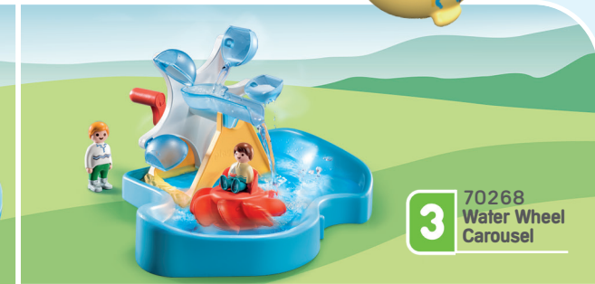
3 70268 Water Wheel Carousel