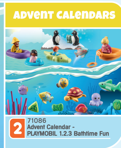
2 71086 Advent Calendar - PLAYMOBIL 1.2.3 Bathtime Fun