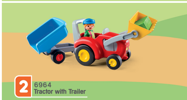
2 6964 Tractor with Trailer