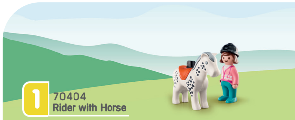
1 70404 Rider with Horse