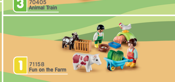
1 71158 Fun on the Farm