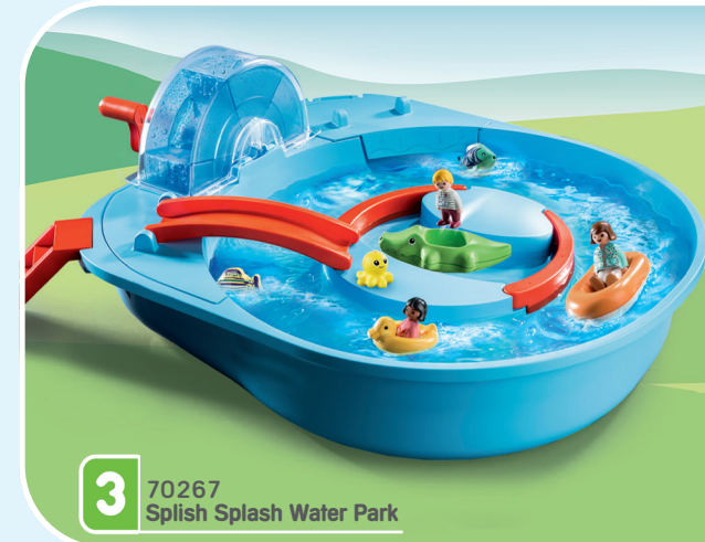
3 70267 Splish Splash Water Park