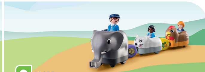
3 70405 Animal Train