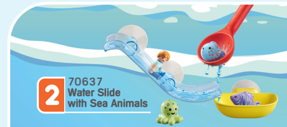
2 70637 Water Slide with Sea Animals