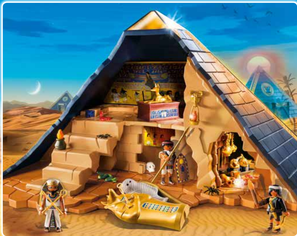
5386 Pharaoh's Pyramid