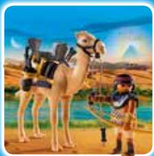
5389 Egyptian Warrior with Camel