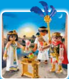
5394 Caesar and Cleopatra