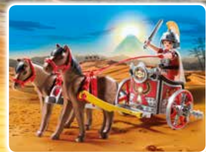
5391 Roman Chariot