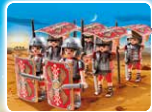
5393 Roman Troop