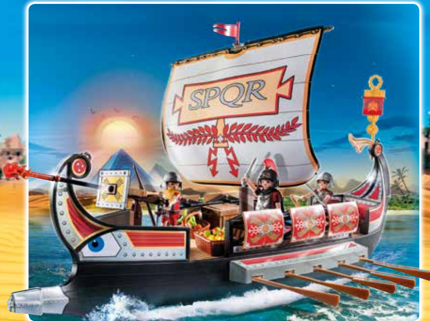
5390 Roman Warriors' Ship