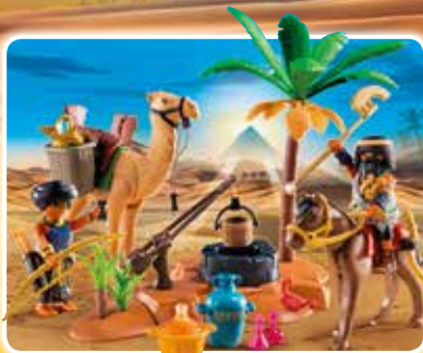
5387 Tomb Raiders' Camp