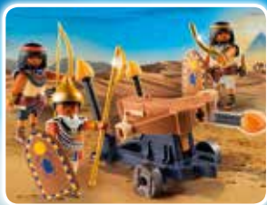
5388 Egyptian Troop with Ballista