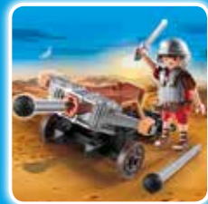
5392 Legionary with Ballista