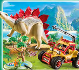
9432 Explorer Vehicle with Stegosaurus