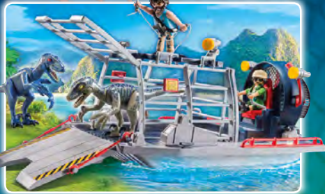
9433 Enemy Airboat with Raptor