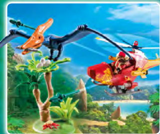
9430 Adventure Copter with Pterodactyl

playmobil is a registered trade mark. ©2018 geobra Brandstätter Stiftung & Co. KG