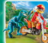
9431 Motocross Bike with Raptor