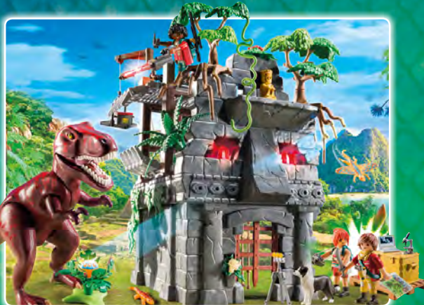
9429 Hidden Temple with T-Rex