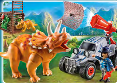
9434 Enemy Quad with Triceratops